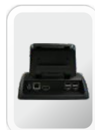
Desktop Charging Cradle